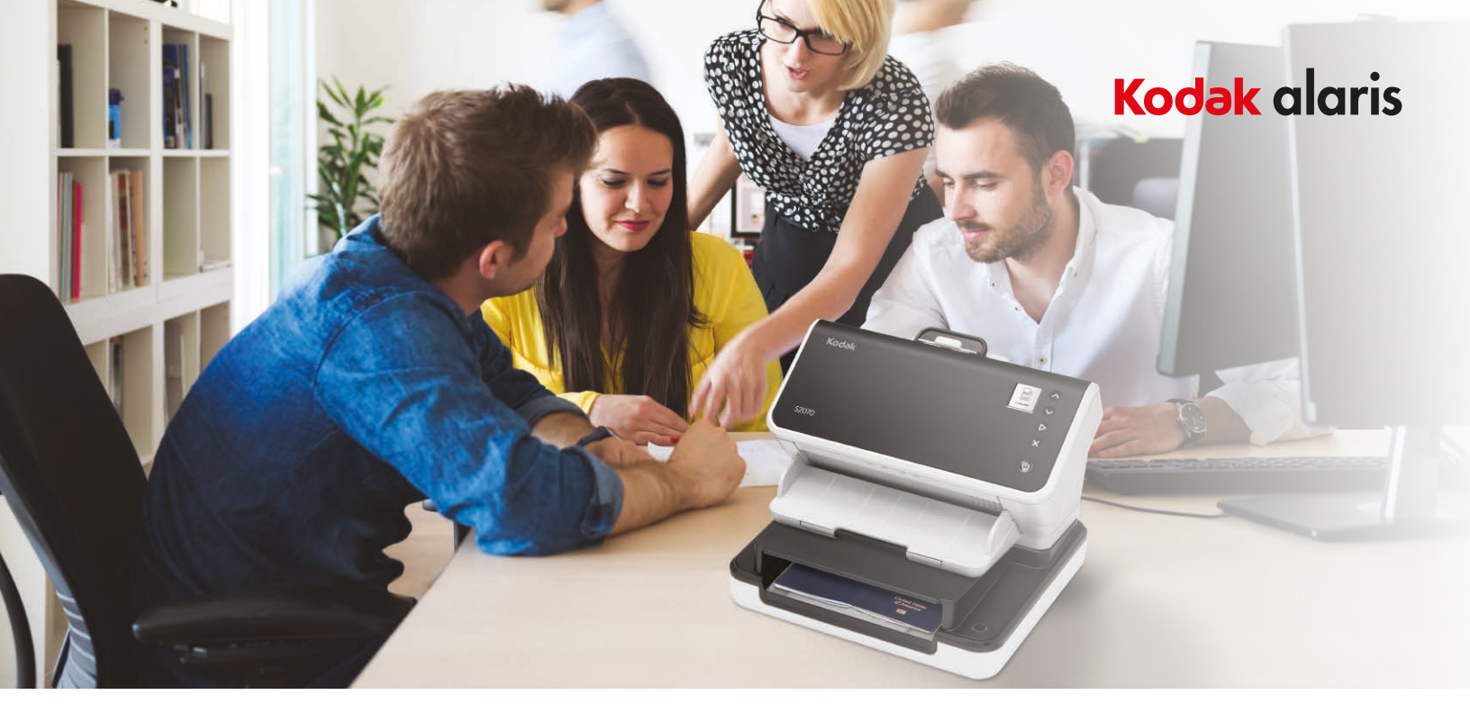
Kodak Passport Flatbed Accessory