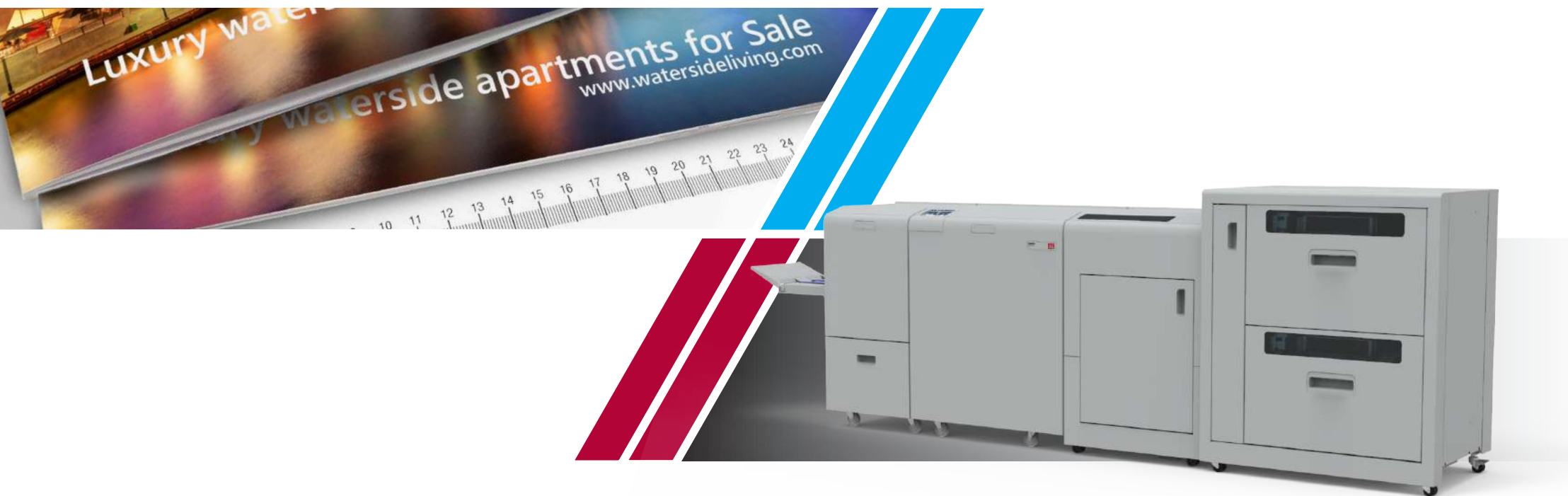
BM4035/BM4050 Series with VFX feeder