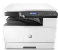
HP LaserJet MFP M42625n