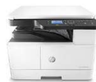
HP LaserJet MFP M42625dn