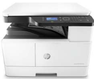
HP LaserJet MFP M42625dn